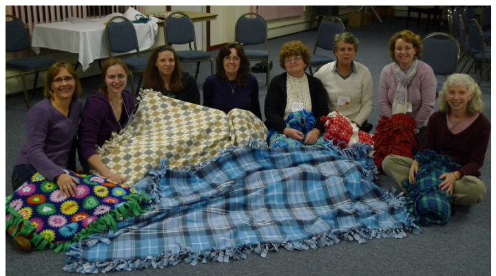
The ladies completed 10 Blankets of Comfort that are given to wounded U.S. soldiers overseas when they are evacuated from combat by medevac.