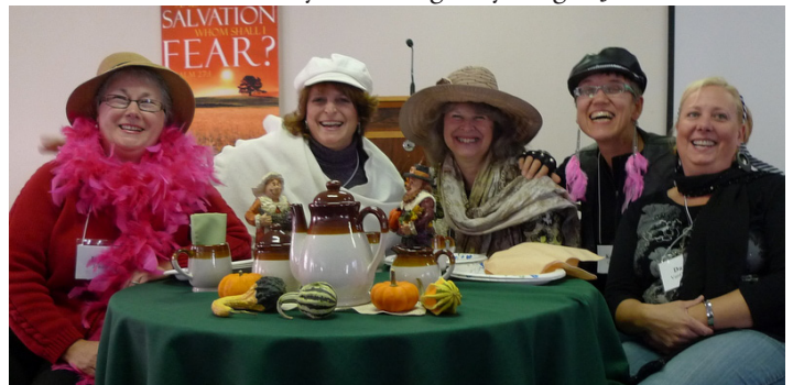
Guest appearance from the now famous “Housewives of Bethel Grove”

Accessed, I can love anyone through anything. I John 4:7-12